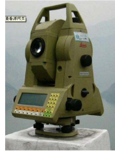
Figure 1 Mine surveying robot

Mine surveying is a comprehensive application of multi-disciplinary knowledge, such as surveying, mining, geology and modern power electronic technology, to study various spatial geometric problems in the process of mine geological exploration, construction and mining under static and dynamic conditions. It belongs to an important branch of mining science and is also an important part of mining science. Mine survey is an indispensable basic technical work in the process of mining development, which needs to be carried out in every stage of exploration, design, construction and production, even after the mine is abandoned. With the rapid development of China's economy, mining and industry have also achieved unprecedented development. However, in traditional mine survey, manual methods are adopted, which require staff to rush to the site to measure, view data and analyze and process them. Because the measuring points are distributed in different positions in the mining area, the workload in the measuring process is heavy, which leads to the waste of a lot of human resources. The research of robot communication system for mine survey is of great significance for reducing the workload of mining enterprises, reducing production safety accidents and the safety of life and property in Protect the people. Mine surveying robot is shown in Figure 1.